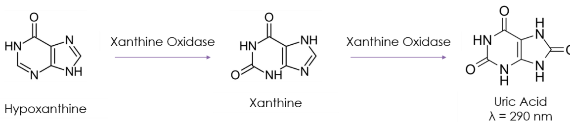
Principle of Xanthine Oxidase Activity Assay Kit

Xanthine oxidase catalyzes the two-step oxidation of hypoxanthine to uric acid and hydrogen peroxide. In this kit, XO activity is determined by measuring the uric acid formation at 290 nm.